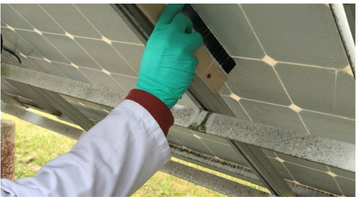
Smoothing the layer